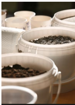
WATER FILTER ACTIVITY, SWS BRAZIL