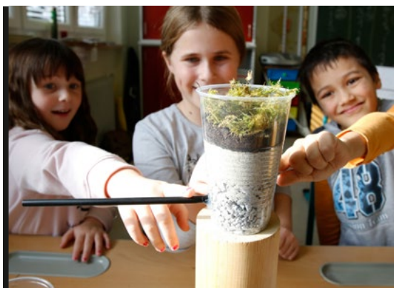
SOIL FILTRATION ACTIVITY, SWS AUSTRIA