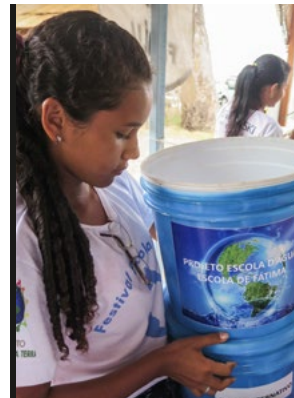
SELF MADE CLAY WATER FILTER, SWS BRAZIL