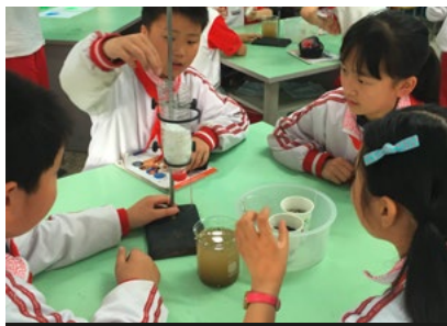
LOCALLY ADAPTED WATER FILTER ACTIVITY, SWS CHINA