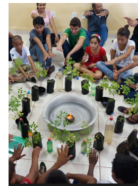
WATER CONNECTS EVERYTHING

This module includes techniques for “educommunication,” which support the idea of spreading the message and giving voice to students who are often not otherwise heard. Applying such techniques will help to create a conscious community, while empowering peers to take local action on water issues and to share in the benefits.